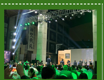
<DIA 2018 award ceremony>