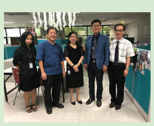
<with Nectec people>