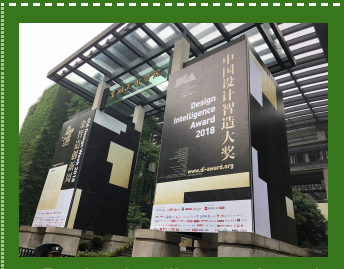
<Design Intelligence Award 2018>