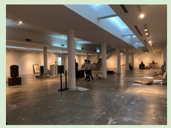
<The space for the exhibitions of award winners>